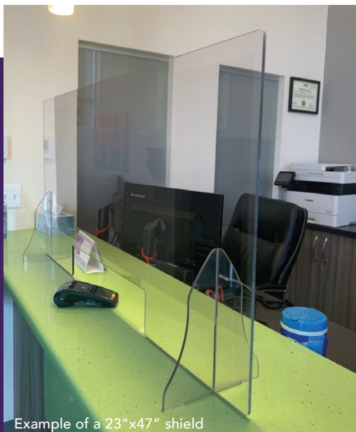
Example of a 23"x47" shield

Available in various sizes in heights and lengths with or without openings.